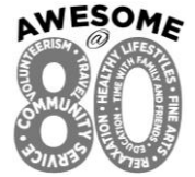
Bookplate design for Bernardine Center book donation

The mission of the Bernardine Center is to provide a helping hand to low-income Chester area residents. The center director said that the books are a welcome addition to the family education programs offered by the Center.