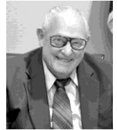
Hank Field Membership Directory

Some sad news: This year, 33 annual members who have not renewed for three years since 2012 have been removed from the membership file. Unfortunately our membership has gone down from 1038 to 849 members since 2012 due to some passing away, unable to locate or non renewal. If you know a retired DELCO school district employee who is not a member of DELCO PASR, please ask them to join. In the past, new members have joined us because of a personal invitation from someone they know.